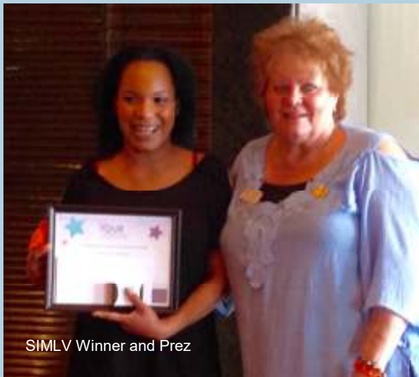
SIMLV Winner and Prez