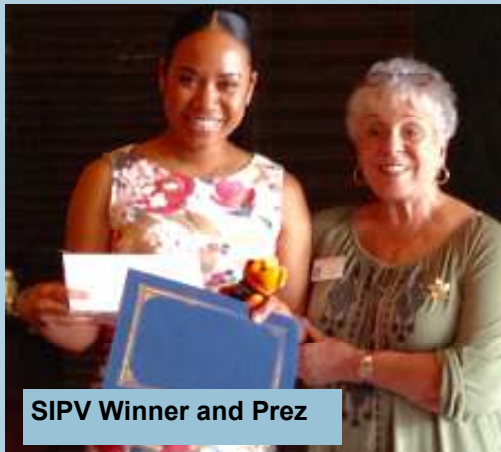
SIPV Winner and Prez