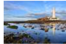
SI Tynemouth, Whitley Bay and District,